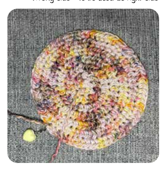
Wrong side - to be used as right side

We will now work in turned, joined rounds. I actually prefer the aesthetic of the wrong side of the htr stitches, so we will be continuing on with the wrong side being on the outside (right side) for the base of the owl. Be careful to not introduce any extra stitches which can be easy to do when working in turned rounds. Please check you have the right number of stitches at the end of each round.